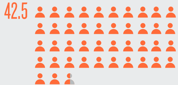
Ophthalmologists per million people