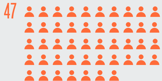
Ophthalmic personnel per million people