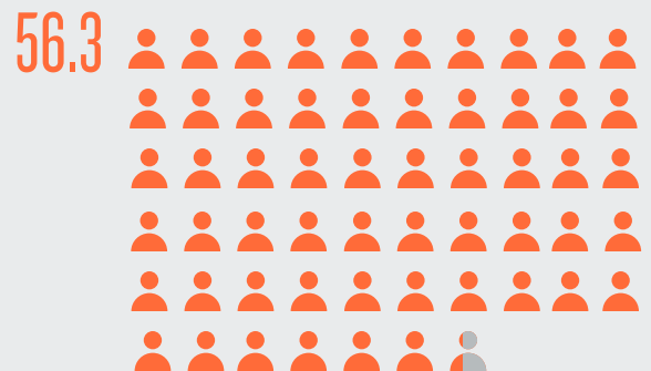
Optometrists per million people